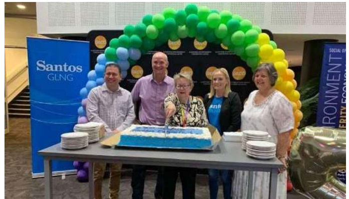
50th Anniversary Celebrations for the Gladstone Eisteddfod

Santos GLNG has been a proud supporter of the Gladstone Eisteddfod and its very talented performers for over a decade. Congratulations to the hard working Eisteddfod volunteers on another successful year.