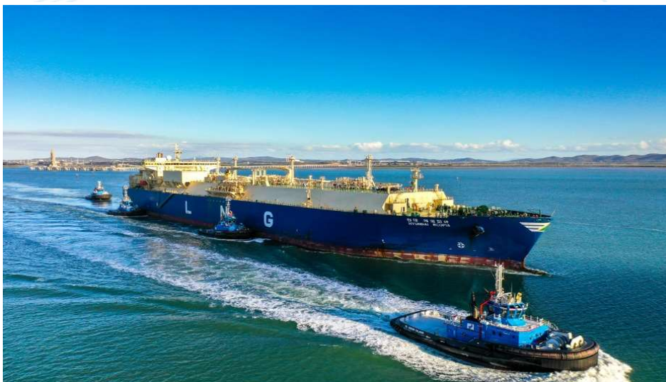
500th LNG cargo departing the Curtis Island facility, near Gladstone

Across Australia, Santos acknowledges the traditional custodians of the lands and waters on which we operate. We recognise and respect their cultural and spiritual beliefs and pay our respects to Elders past, present and emerging