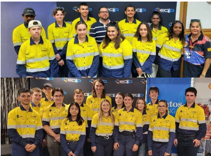
EQIP and PREQIP students celebrate success at recent graduations