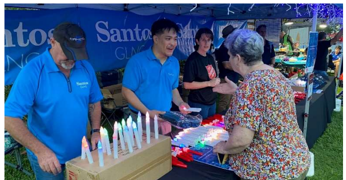
Santos GLNG volunteers at the Santos GLNG Mayor's Carols

The festive season was kicked off in traditional style with the annual Santos GLNG Mayor's Carols on Friday 3 December. Now in our 11th year of partnering with this Gladstone family favourite, GLNG's team of volunteers alongside The Salvation Army sold a massive number of illuminated candles and picnic blankets raising over $1,300 for the Salvo's Christmas Appeal for local families. The event was another success and big thanks go to GLNG's dedicated volunteers who take the time to help every year.