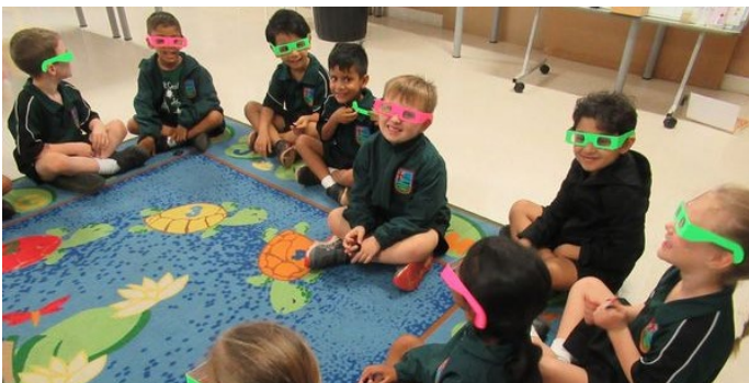
Primary students in Port Hedland taking part in a STEM school incursion

As part of the Primary, Australian, Literacy and Maths program sponsored by Santos, almost 400 primary school students in Port Hedland participated in hands on Science, Technology, Engineering and Maths (STEM) incursions. This national program is run by Aus Earth Ed and includes teacher resources, professional development, and school-based events, to spark interest in STEM and improve the quality of STEM learning in primary schools. Looks like they had fun!