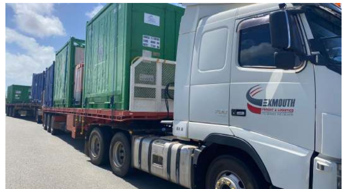
EFL Road Train – Loaded with food stores for the Ningaloo Vision FPSO