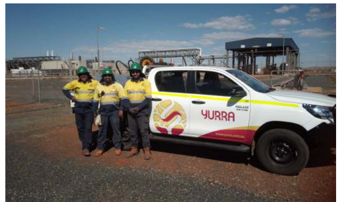
Yurra team members

Yurra has a workforce of 149 employees with 45 per cent indigenous engagement (local), 32per cent female representation, 13per cent indigenous representation in the management team, 30 per cent female representation on the Board, and 30 per cent Yindjibarndi representation on the Board.