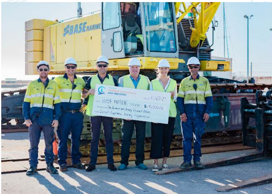
Exmouth CCI and Base Marine receive funding support for establishment of RTO

Across Australia, Santos acknowledges the traditional custodians of the lands and waters on which we operate. We recognise and respect their cultural and spiritual beliefs and pay our respects to Elders past, present and emerging.