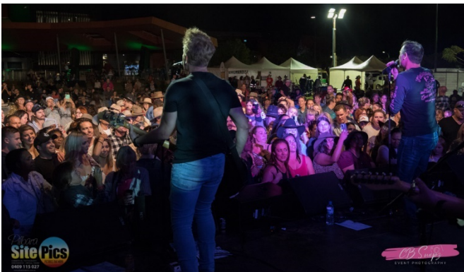
Red Country Music Festival in Karratha in June

Kasey Chambers, Adam Brand and Fanny Lumsden headlined the event, support by several WA and Pilbara artists. While in the Pilbara, Fanny Lumsden also held a mentoring session with local girls interested in the music industry and Kasey Chambers travelled to Roebourne to deliver a fun-filled, child friendly concert to the families in the community. In their commitment to give back to the Pilbara Community, event organisers engaged numerous local companies (including three solely owned indigenous companies) to assist with the event, prioritising support of small businesses.