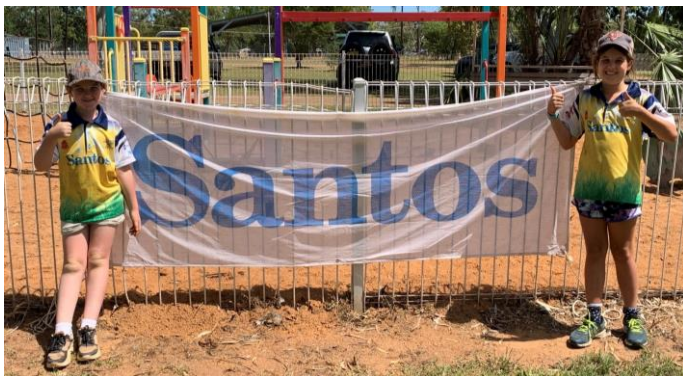
Thumbs up from students at the 2021 Mataranka Sports Camp

All meals and coordination of the event were organised by local volunteers of the Isolated Children’s Parents Association (ICPA) Katherine Branch of which Santos is a proud sponsor. We’d like to express our gratitude to everyone who volunteered their time to help make this sports camp fun and rewarding for children who study via distance education.