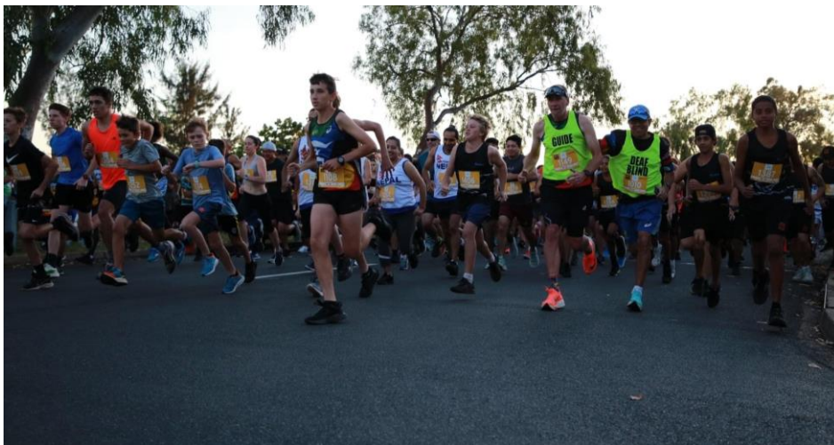
Ready, get set, go! Participants take off at the 4km Minisurfer starting line

Across Australia, Santos acknowledges the traditional custodians of the lands and waters on which we operate. We recognise and respect their cultural and spiritual beliefs and pay our respects to Elders past, present and emerging.