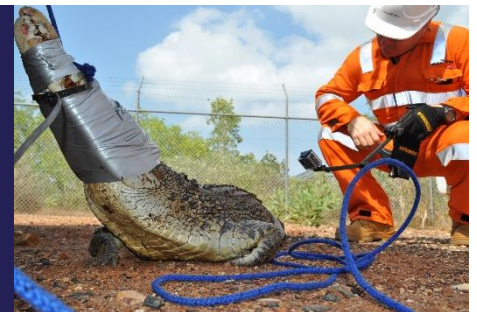
Croc found in Darwin LNG Sediment Pond in 2017

Outside of work, I am a volunteer with Bushfires NT where I get to witness Santos' involvement in the NT community through its Carbon Abatement Program. Santos contributes to Bushfires NT and West Arnhem Land local communities by providing financial support for the early dry season burn-off of fire breaks. Without the early dry season burn-off, devastating bushfires are more intense, burn out the canopy of trees and destroy vast tracts of land. Learn more about the West Arnhem Land Fire abatement project here .