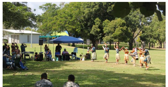
Mer Peibre Dance and Cultural Troupe dancer's performance at the Jingili Water Gardens