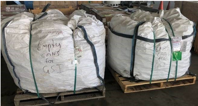
The first load of containers delivered to GSE under Containers for Change

Santos is supporting long-term community partner Good Sammy Enterprises (Good Sammy) under the Containers for Change program.