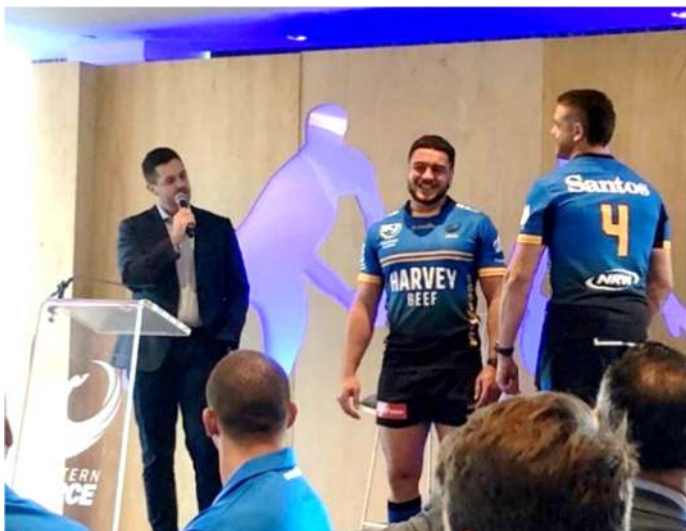
The Western Force season launch in Perth