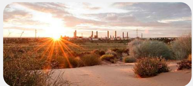
Since 1969, Santos' Moomba plant has been supplying natural gas to Australian homes and businesses.

From providing jobs and supporting local manufacturers, to heating your home and firing up your barbecue – Santos' natural gas is part of Australia.