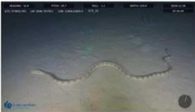
Horned sea snake ( Acalyptophis peronii ) in demersal, soft sediment habitat, 130m water depth.

Below are some photos from the habitat survey that was undertaken last December, as part of the information gathering process for the OPP.