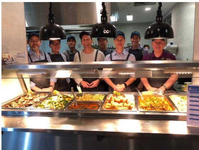
Santos crew supporting RMHC by cooking meals for seriously ill children and their families whilst in Perth for medical treatment.

This is a great initiative and we encourage all our supporters to contact Ronald McDonald House Charities (WA) to “reconnect over dinner”.