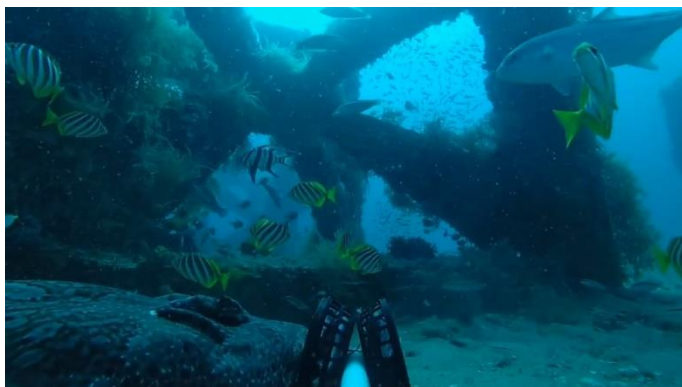
Example of an artificial reef.

Santos has recently joined with Recfishwest as a supporting partner of their 2020 Artificial Reef Research program.