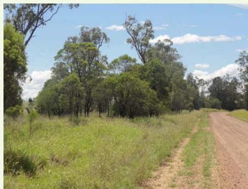
Photo 2 Typical floristic structure of road reserve areas