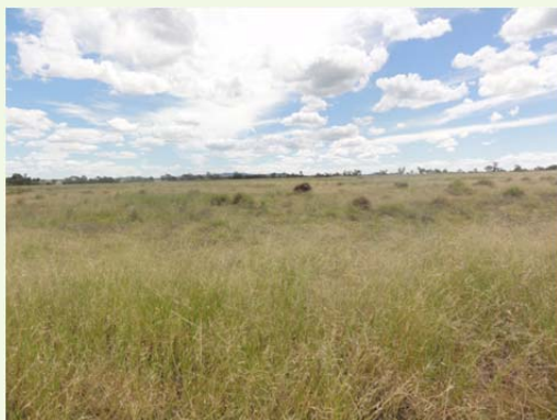
Photo 1 Typical floristic structure of the proposed development areas