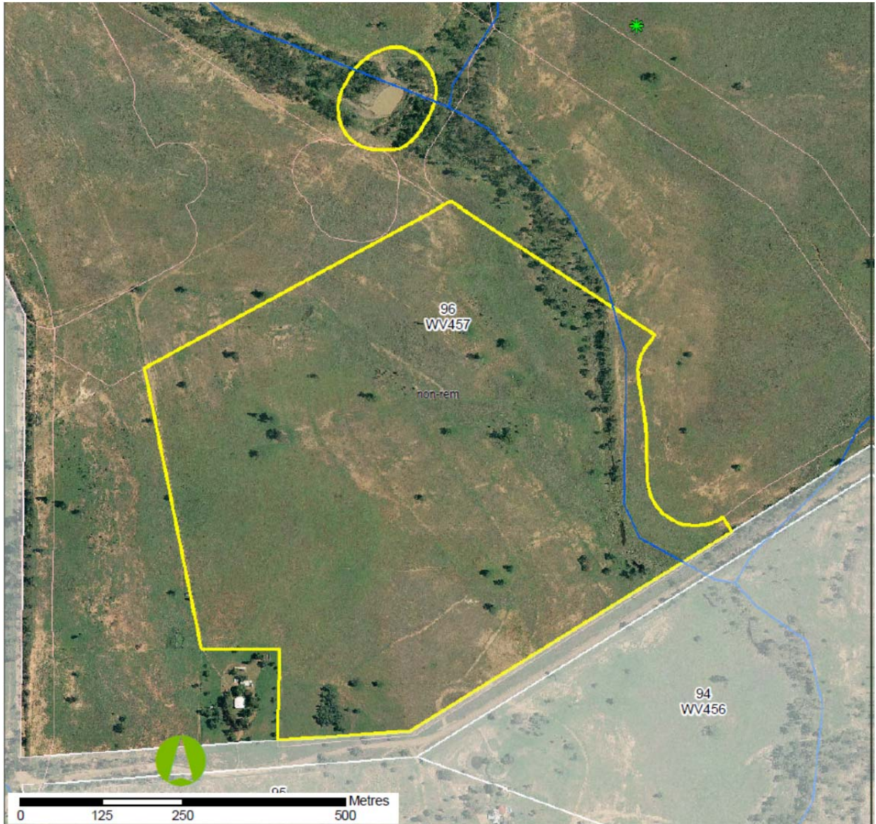
Figure 1 – Lot 96 WV457 Assessment Area