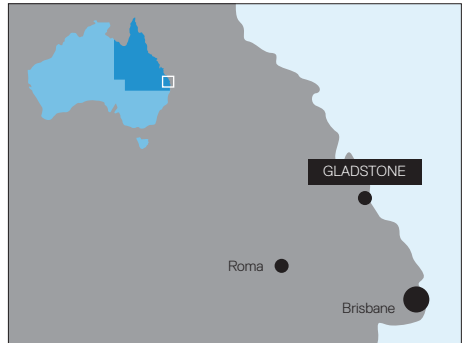
Figure 3 – Locality map

Detailed assessments conducted during the design and construction of the facility shows that possible Major Incidents are not expected to cause any immediate impact beyond the GLNG Facility boundary.